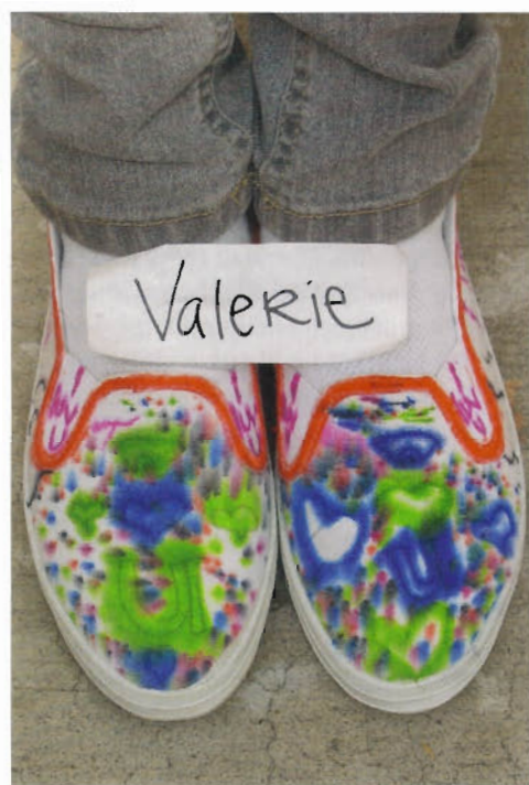
Through "Walk in Your Art," students at Sacramento's Mustard Seed School colorfully decorated their own canvas shoes.

The high schoolers helped students create another Pollock-inspired mural that currently is on display in the school's Dorothy Day classroom. In an effort cleverly entitled, "Walk in Your Art," the girls also gave the kids canvas tennis shoes and helped decorate them.