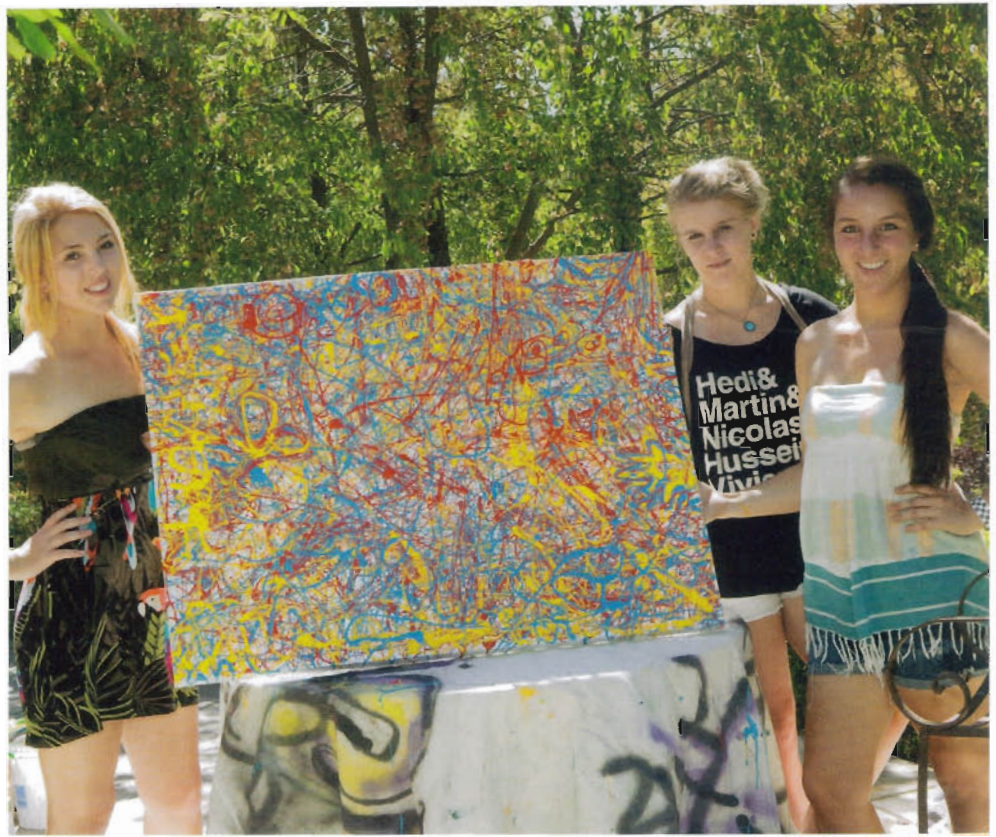
The girls display one of their Jackson Pollock-inspired paintings that was donated for auction at the El Dorado Hills Community Vision's Oct. 30 Masquerade Ball.